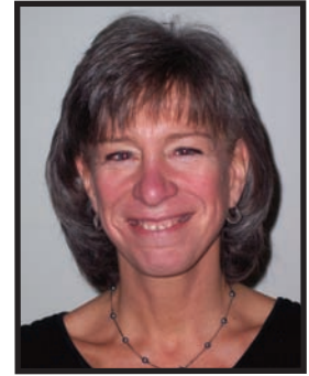
By Ronna Wallace

And finally, the following concepts have been proven to save money and improve patient care. Concurrent with payment reform, they should be included in any state healthcare cost containment initiative: